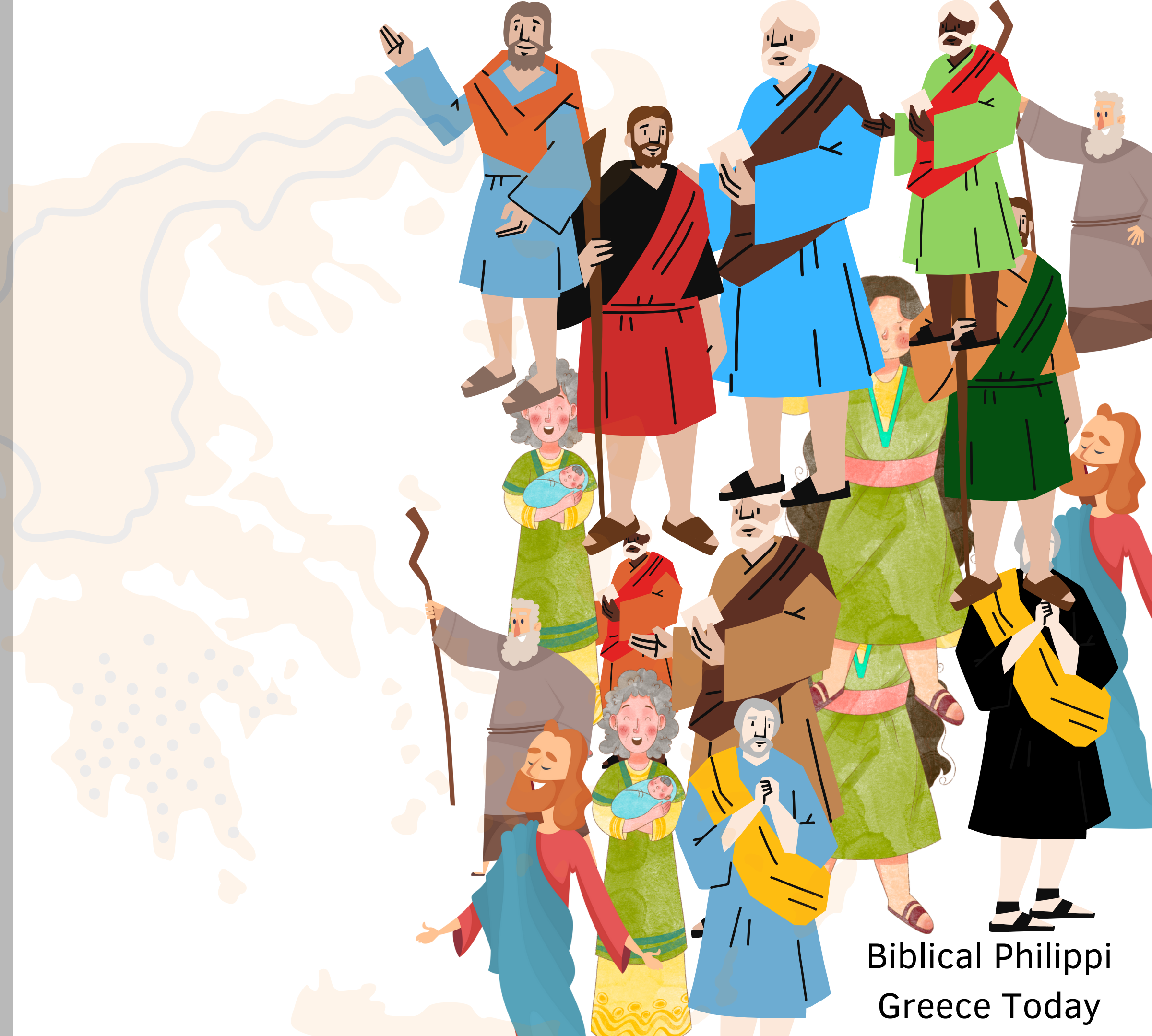
Biblical Philippi Greece Today