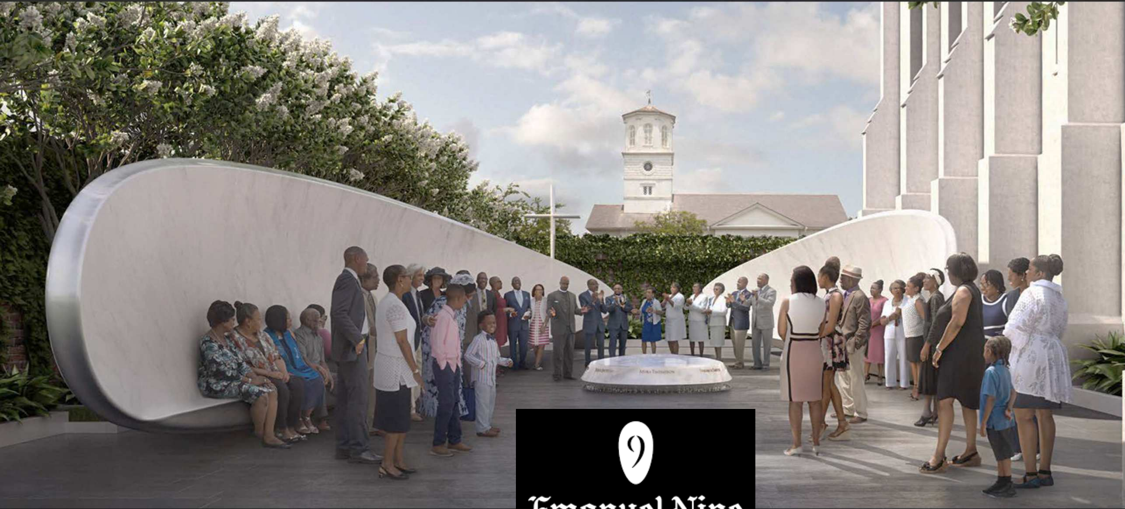
9 Emanuel Nine Memorial